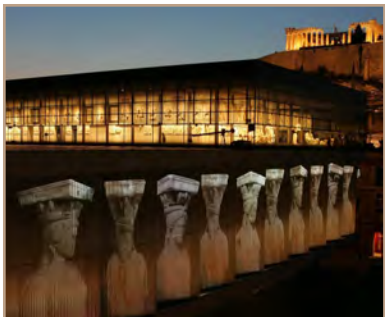
(see the brochures at our desk on the ground floor)

Acropolis New Museum: The museum is located by the southeastern slope of the Acropolis hill, on the ancient road that led up to the "sacred rock" in classical times. The motivation for the construction of the new museum was that in the past, when Greece made requests for the return of the Parthenon Marbles from the United Kingdom.