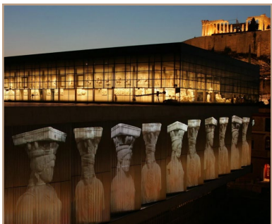
(see the brochures at our desk on the ground floor)

Acropolis New Museum: The museum is located by the southeastern slope of the Acropolis hill, on the ancient road that led up to the "sacred rock" in classical times. The motivation for the construction of the new museum was that in the past, when Greece made requests for the return of the Parthenon Marbles from the United Kingdom.