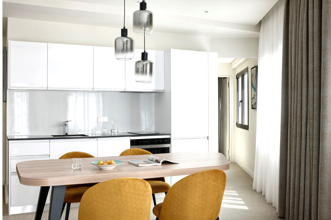
the Place Asklipiou 9